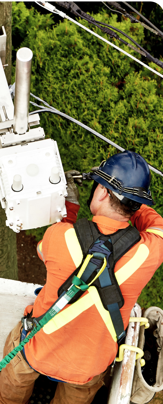
Figure 2. All Cisco Catalyst industrial routers are field upgradable (IR8140 shown)

within the IP suite. Cisco's commitment to interoperability helps utilities simplify systems, lower costs, and improve uptime.